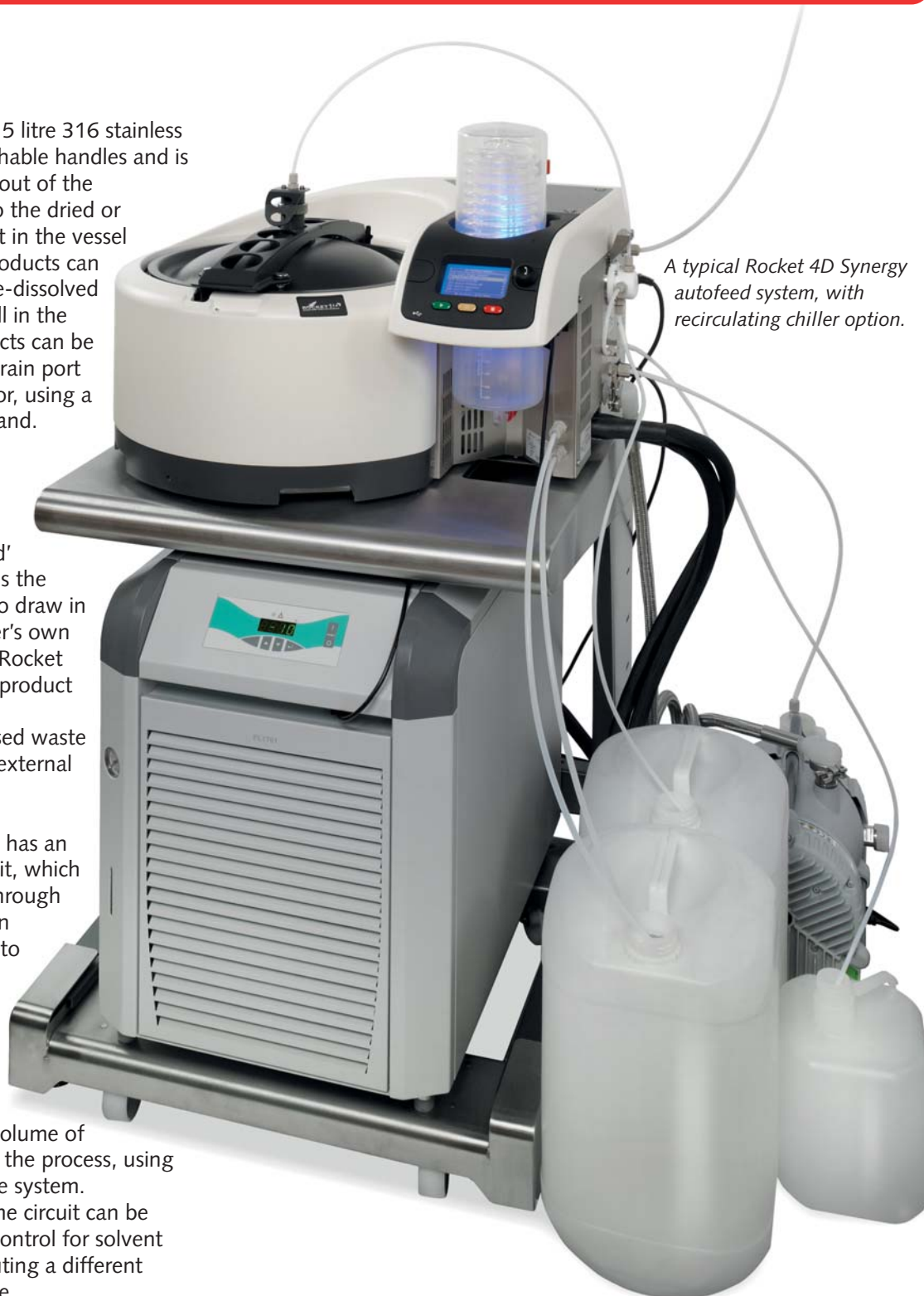
A typical Rocket 4D Synergy autofeed system, with recirculating chiller option.

Cleaning the Rocket 4D Synergy between cycles is very straightforward. The PTFE feed tubing is easily detached for cleaning or replacement and the vessel can be readily cleaned, wiped, inspected and even put in a dishwasher. It's all so easy compared with handling large glass evaporator flasks!